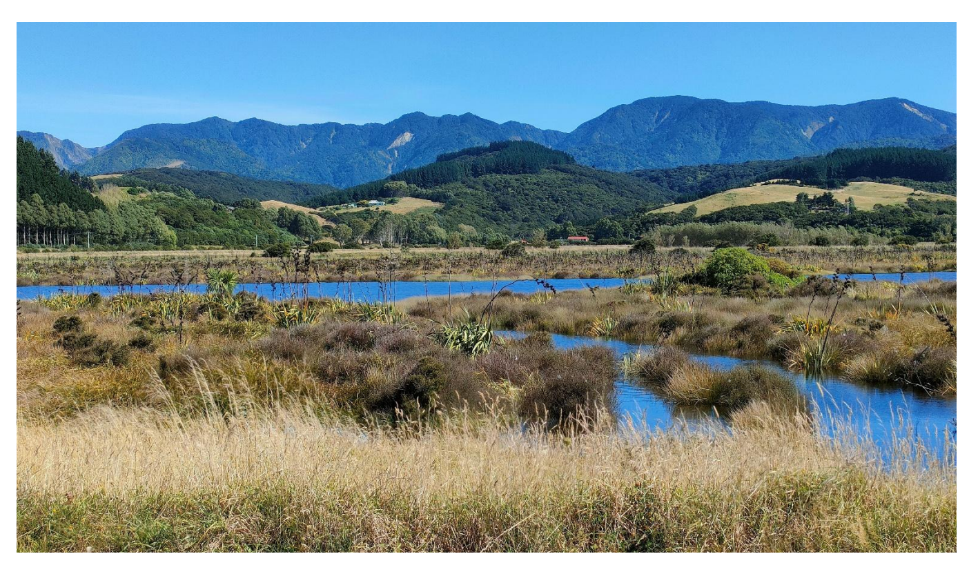
from Pounui Lagoons looking back towards the western side of the valley

The second was a look at wetlands at the southern part of Western Lake Road. We walked past the Pounui Lagoons to the area where the Ruamāhanga River meets Lake Ōnoke. This walk was along stop banks, and you could see that the water was kept at different levels at the wetlands and in adjacent farmland. The pump was operating while we were there. Sadly, no Australasian bittern <a href="https://www.nzbirdsonline.org.nz/species/australasian-bittern">https://www.nzbirdsonline.org.nz/species/australasian-bittern</a> wanted to be spotted that day.