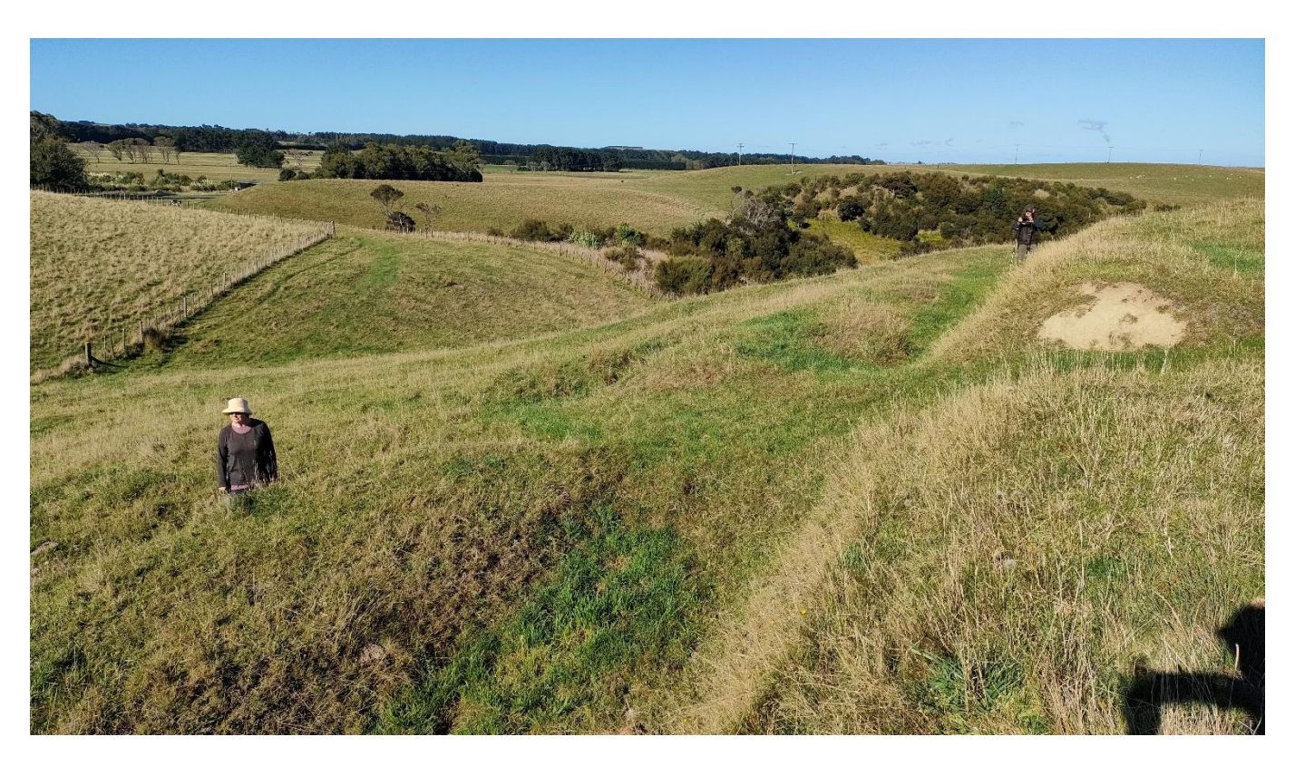
Double ditch structure at the Pirinoa archeological site