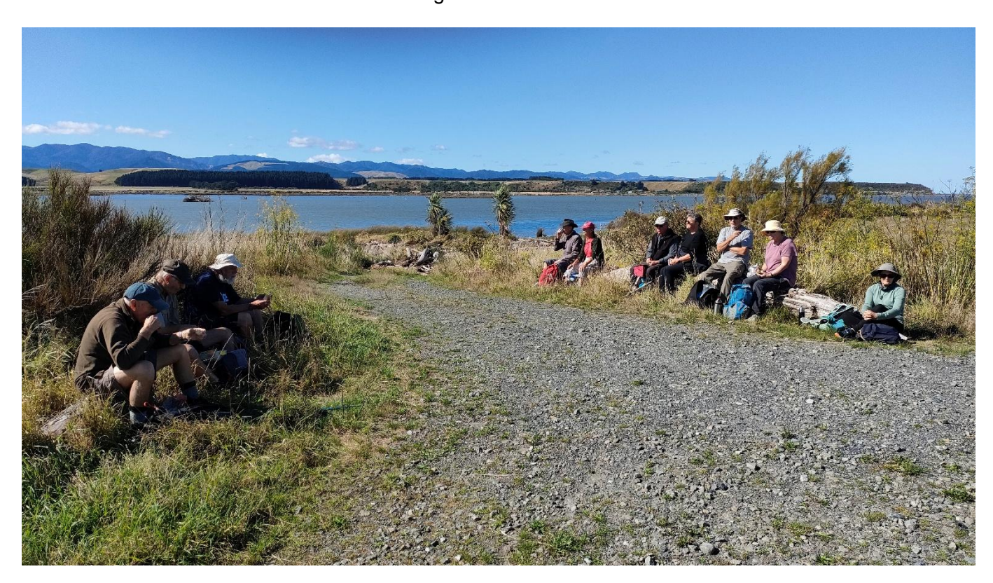
Where the Ruamāhanga meets Lake Ōnoke