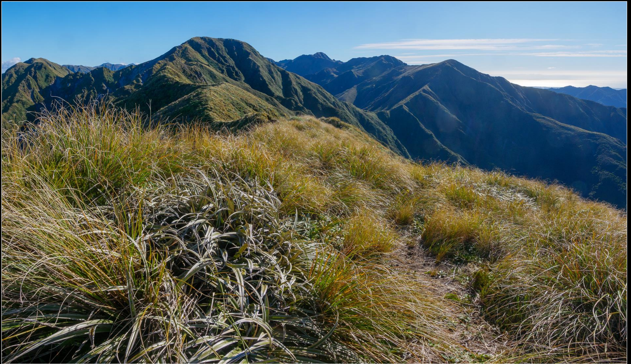
Haukura Ridge, East Peak and Dundas Ridge from Ruapae