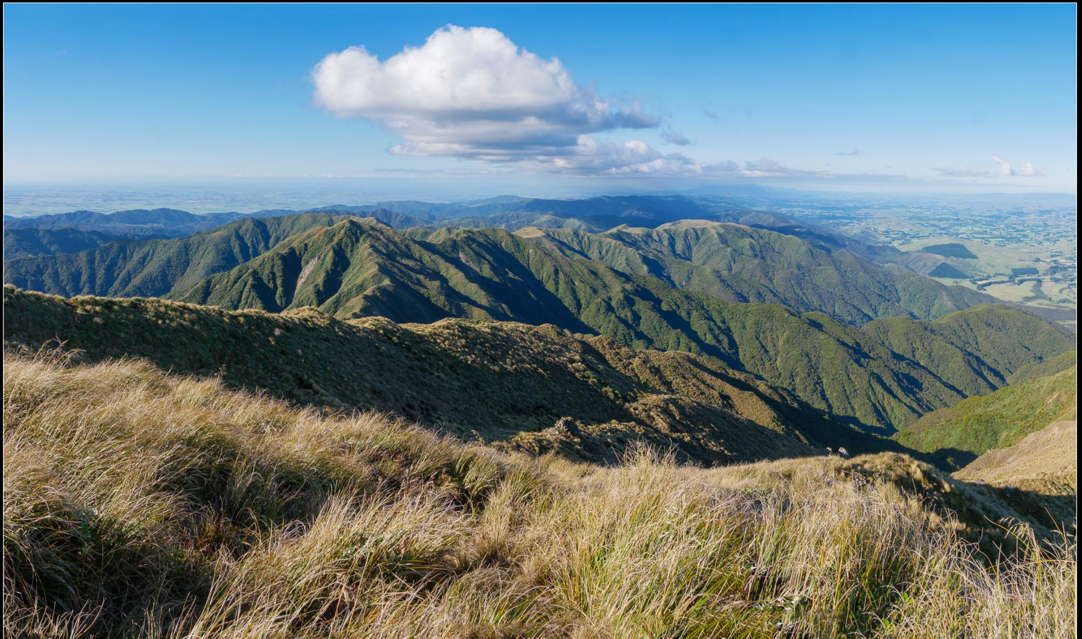
The Hines-Kareti-Massey-Conical Knob-Ngamaia ridge, from Ruapae