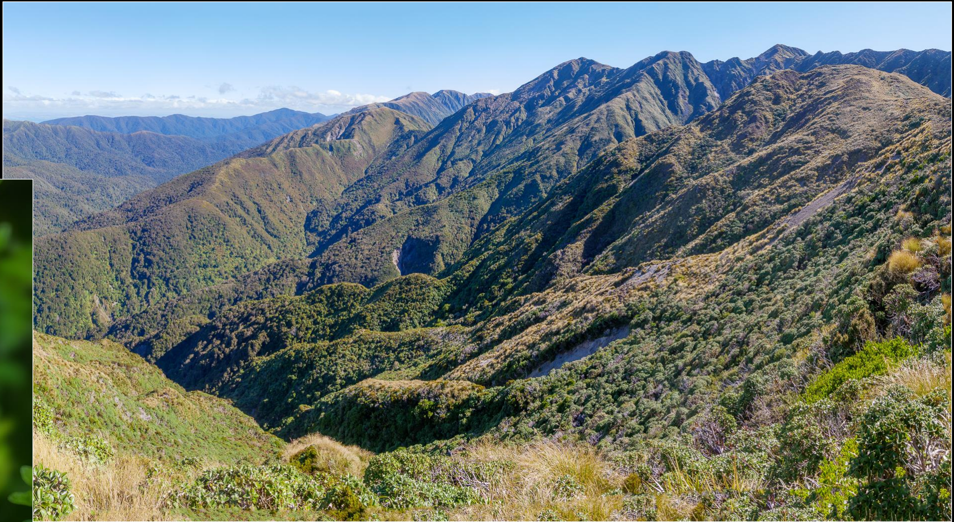
Haukura Ridge from the climb to Ruapae