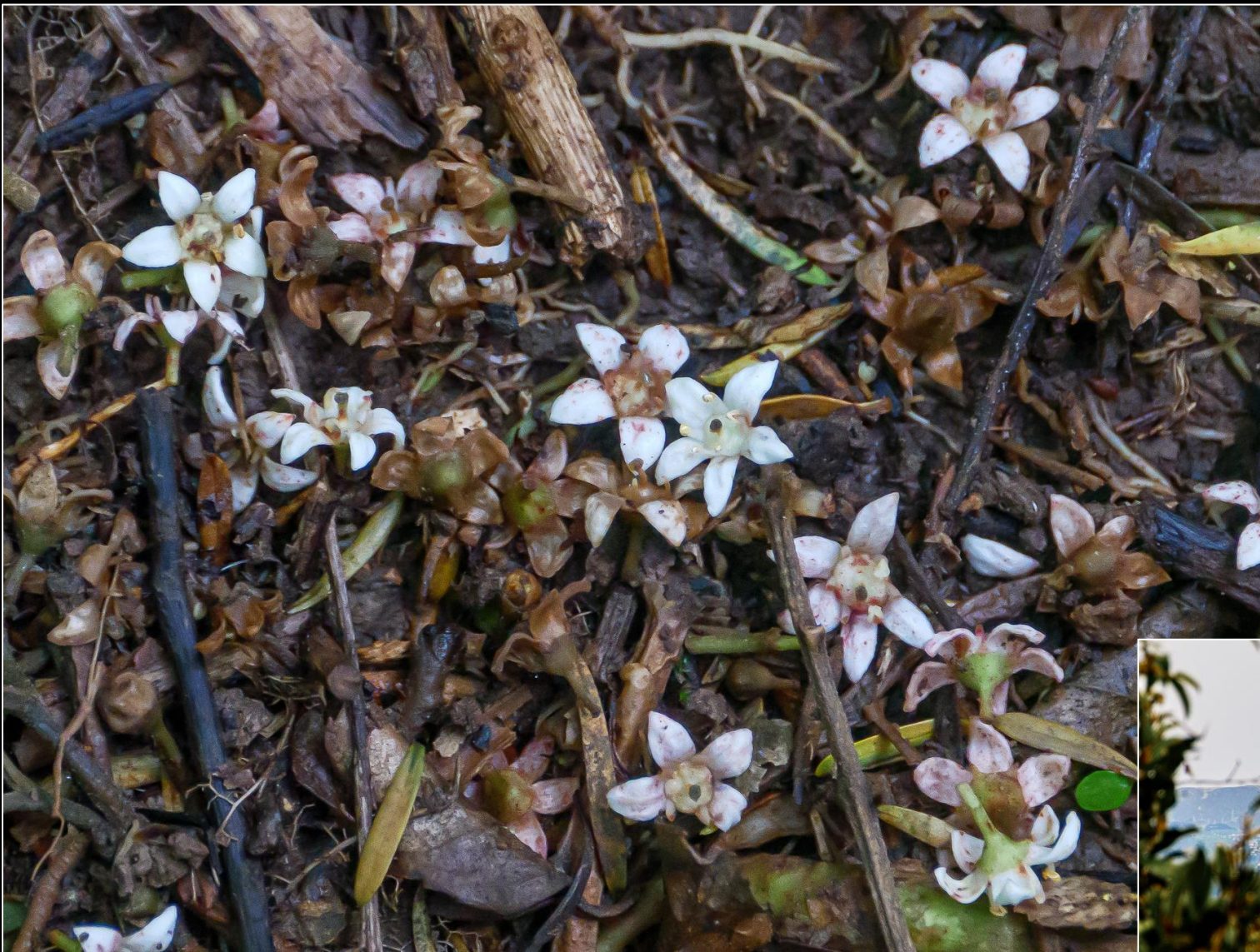
Flowers of putaputaweta ( Carpodetus serratus )