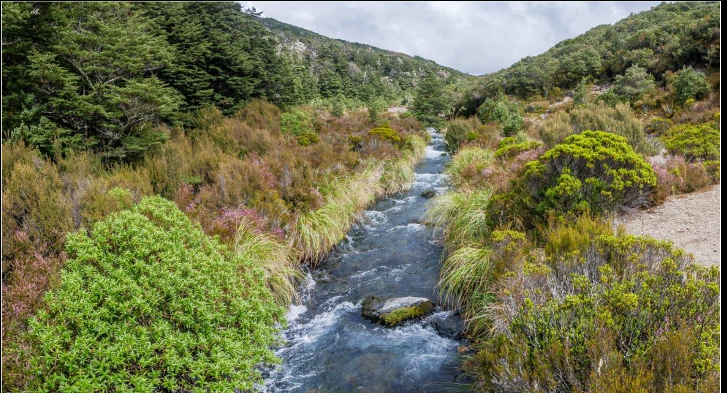
Waihohonu Stream (middle branch)