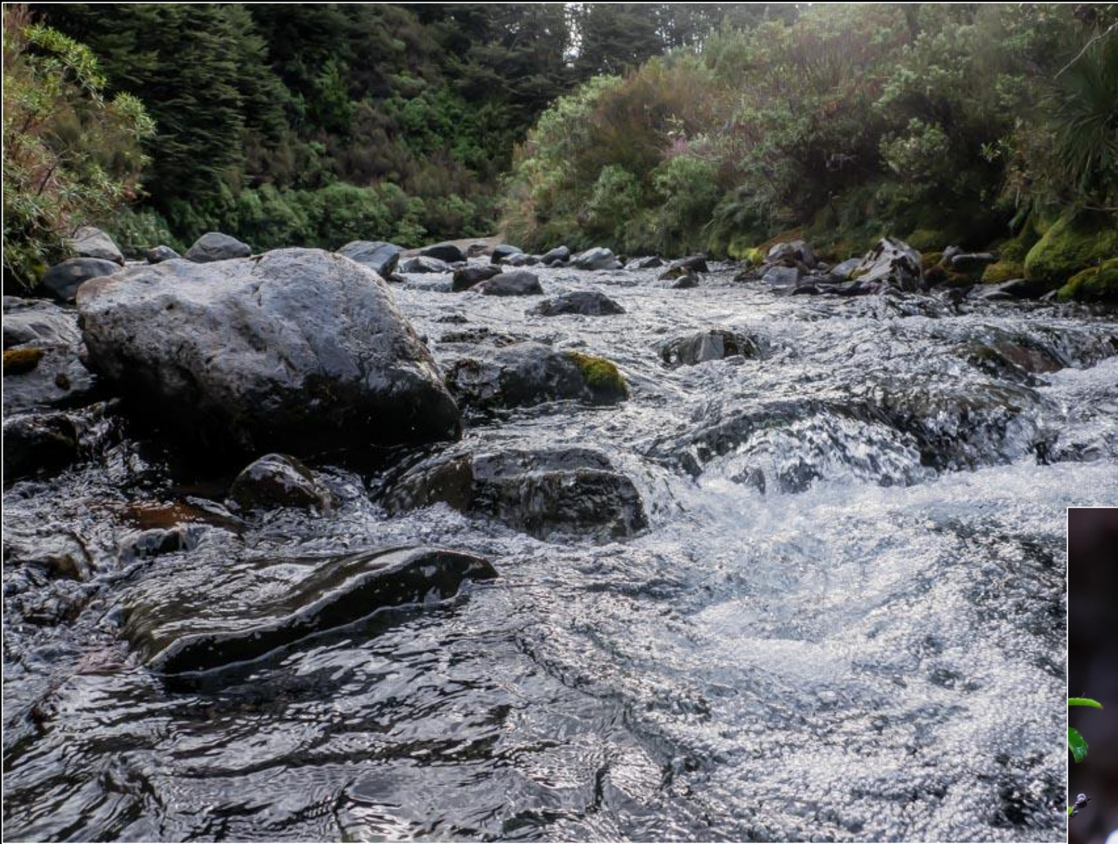
Waihohonu Stream (south branch)