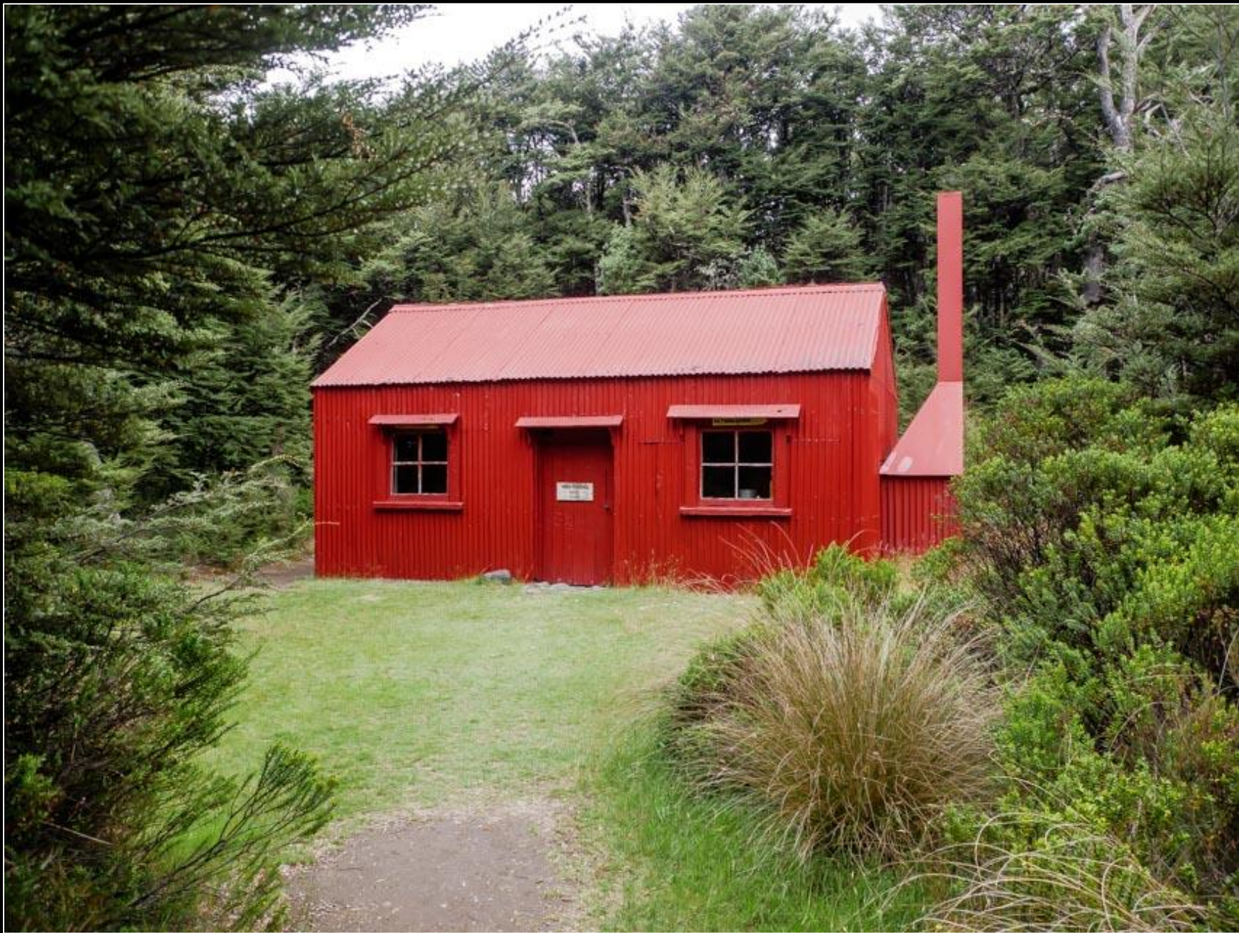
Old Waihohonu Hut (1904)