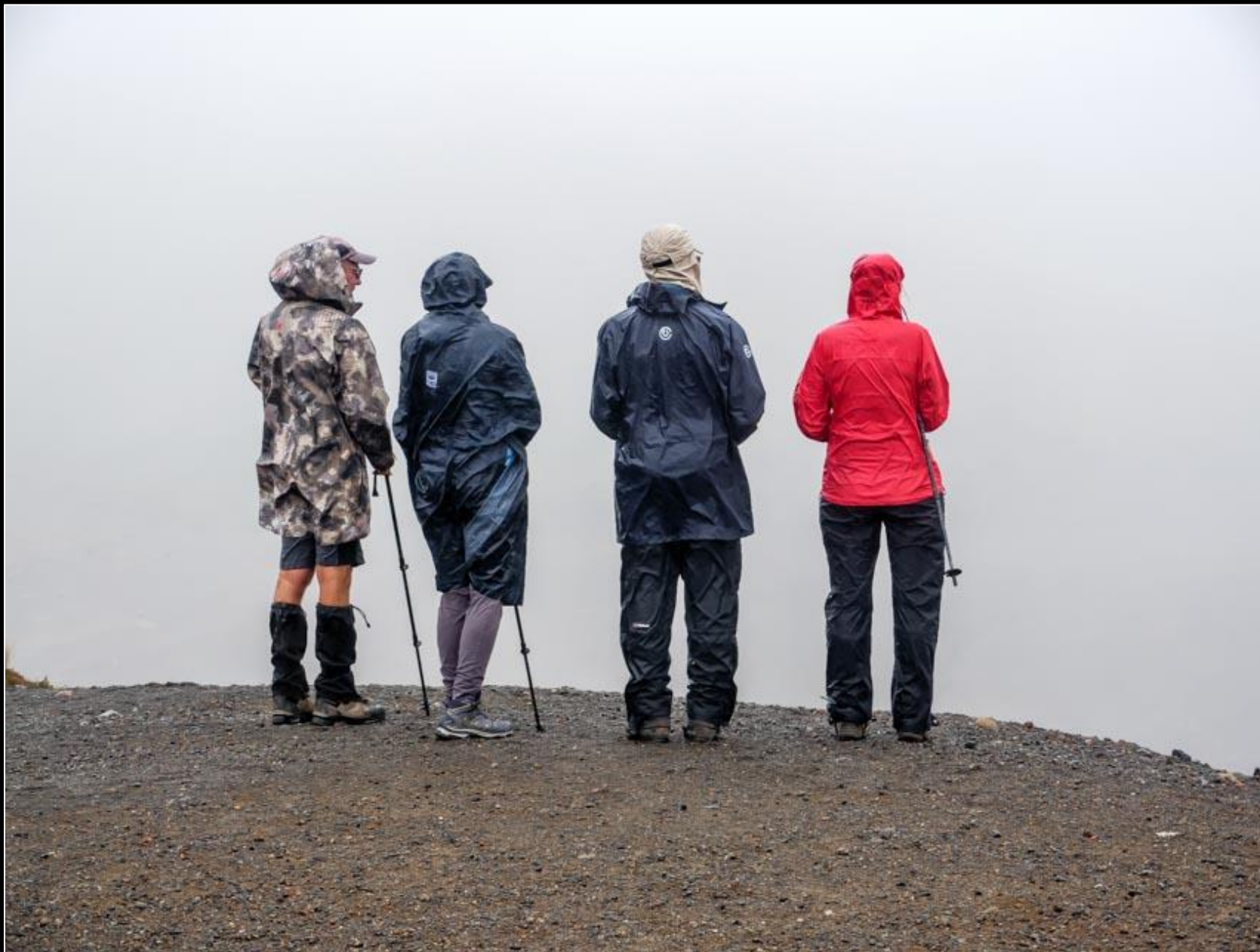
Lower Tama Lake