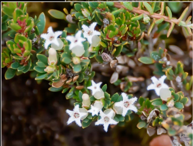
Pentachondra pumila and Oturere Hut