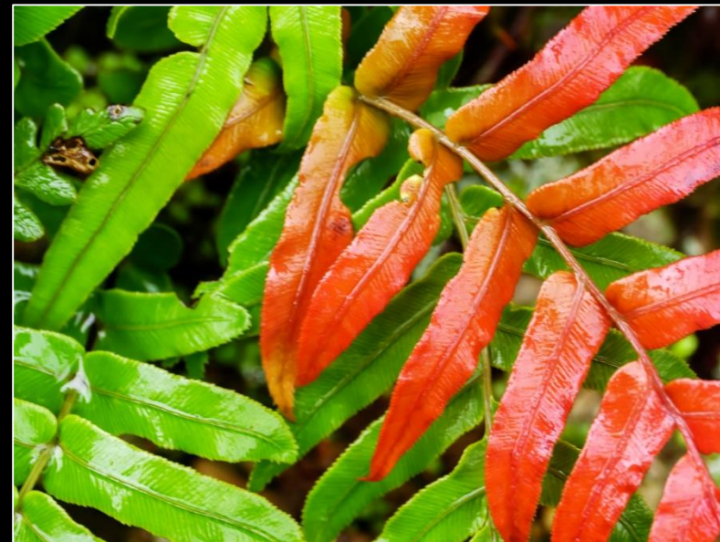
Blechnum discolor & Parablechnum novae-zelandiae