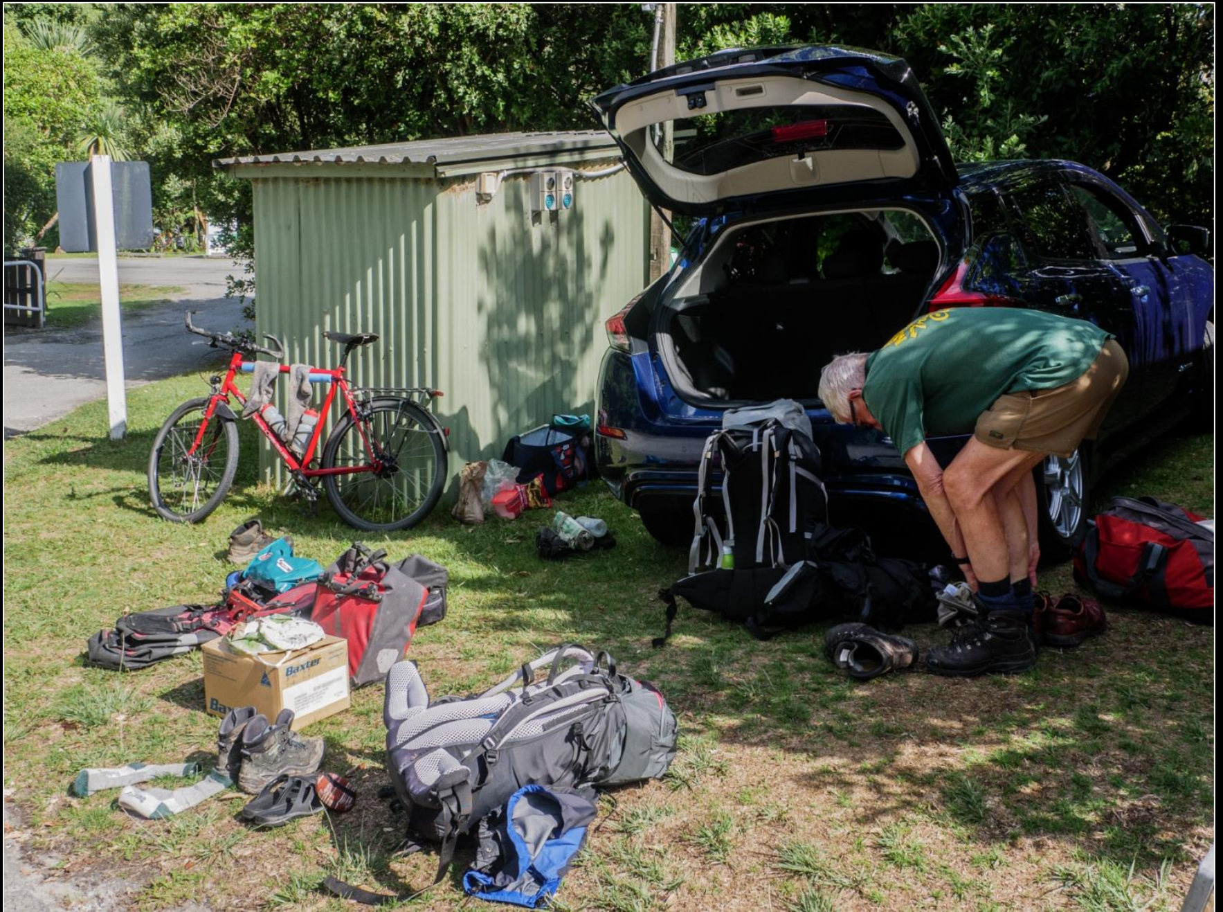
The end of a great walk!