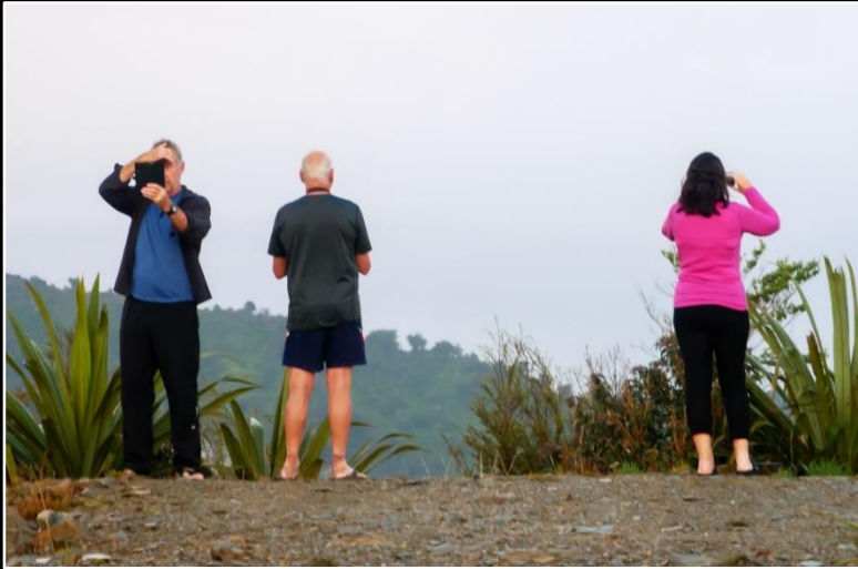
Clearing sky on the last day