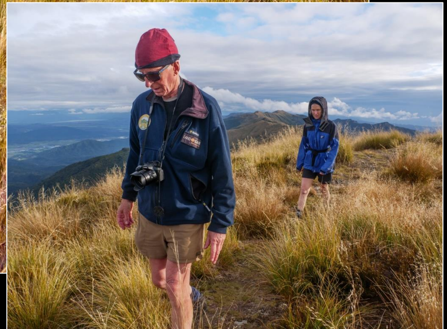
Looking north from Croesus. This is where we'll be going tomorrow.