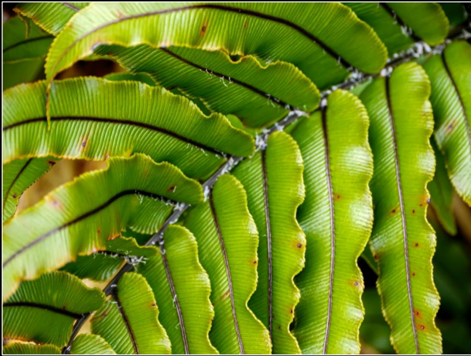
Blechnum novae-zelandiae & Astelia nervosa