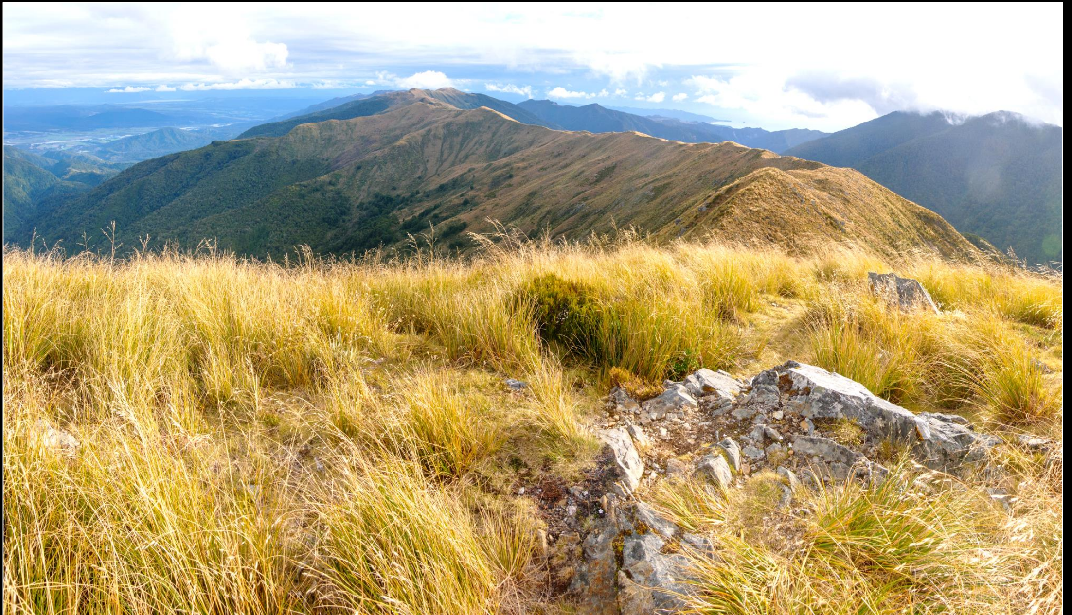
Looking south from Croesus