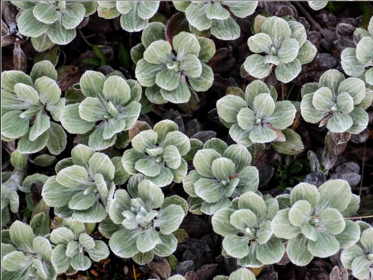
Celmisia discolor & Pentachondra pumila