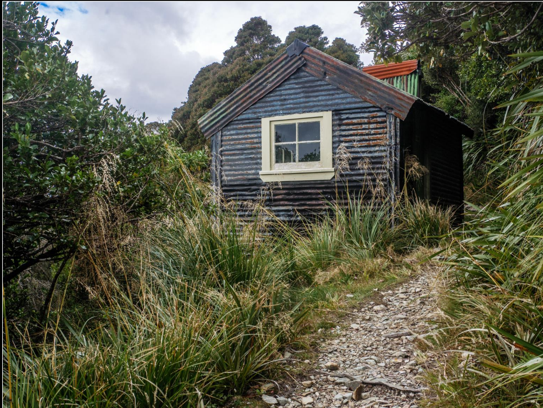
Croesus Top Hut