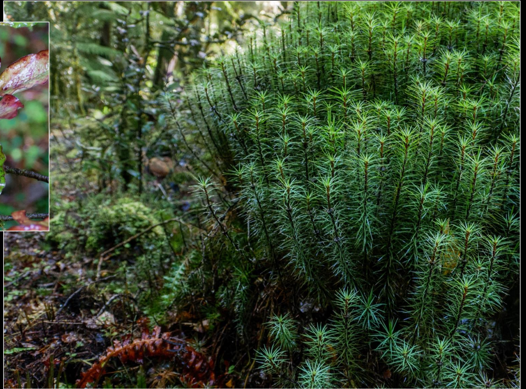
Pseudowintera colorata & Dawsonia superba