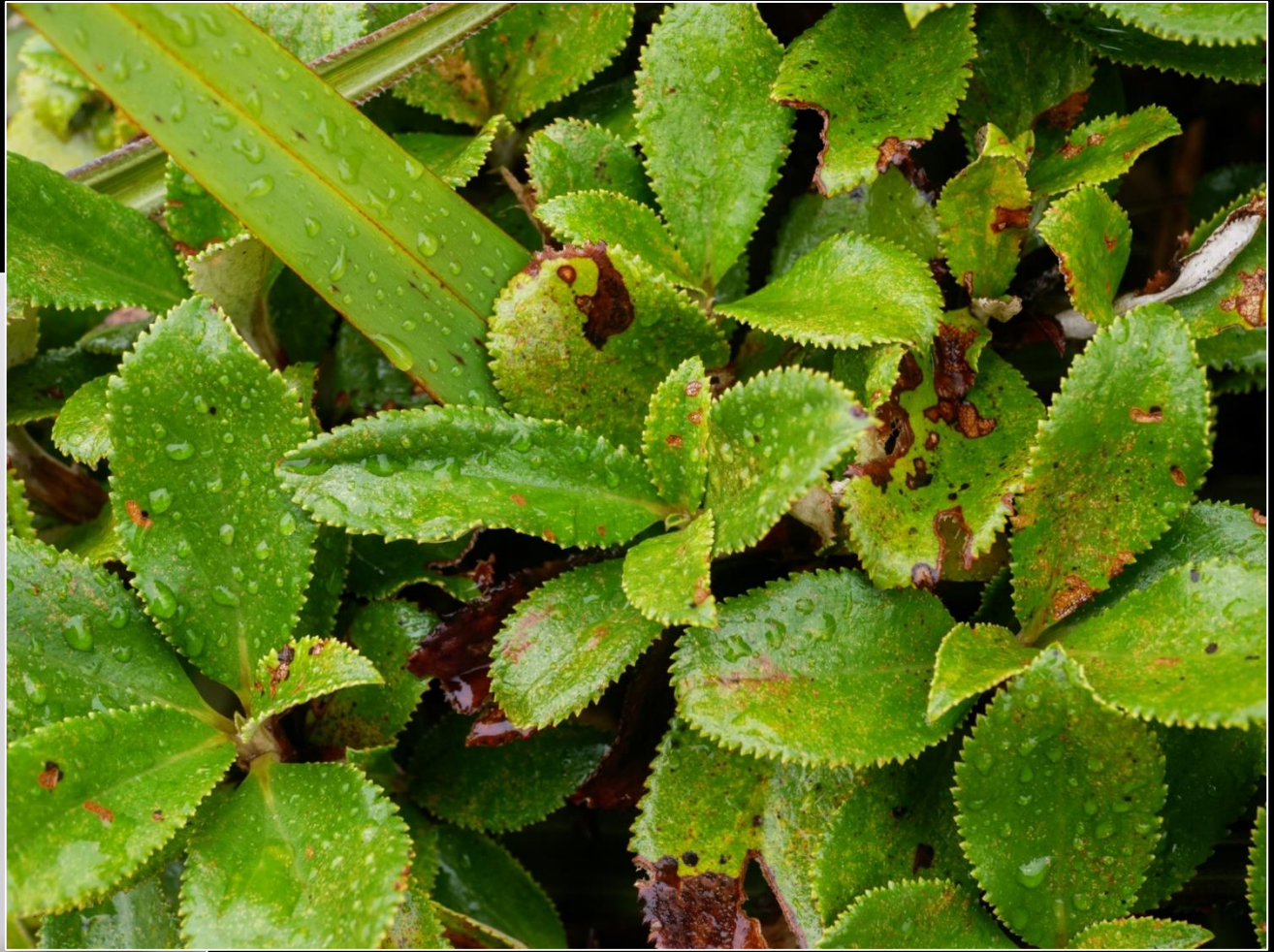
Phormium cookianum & Macrolearia colensoi