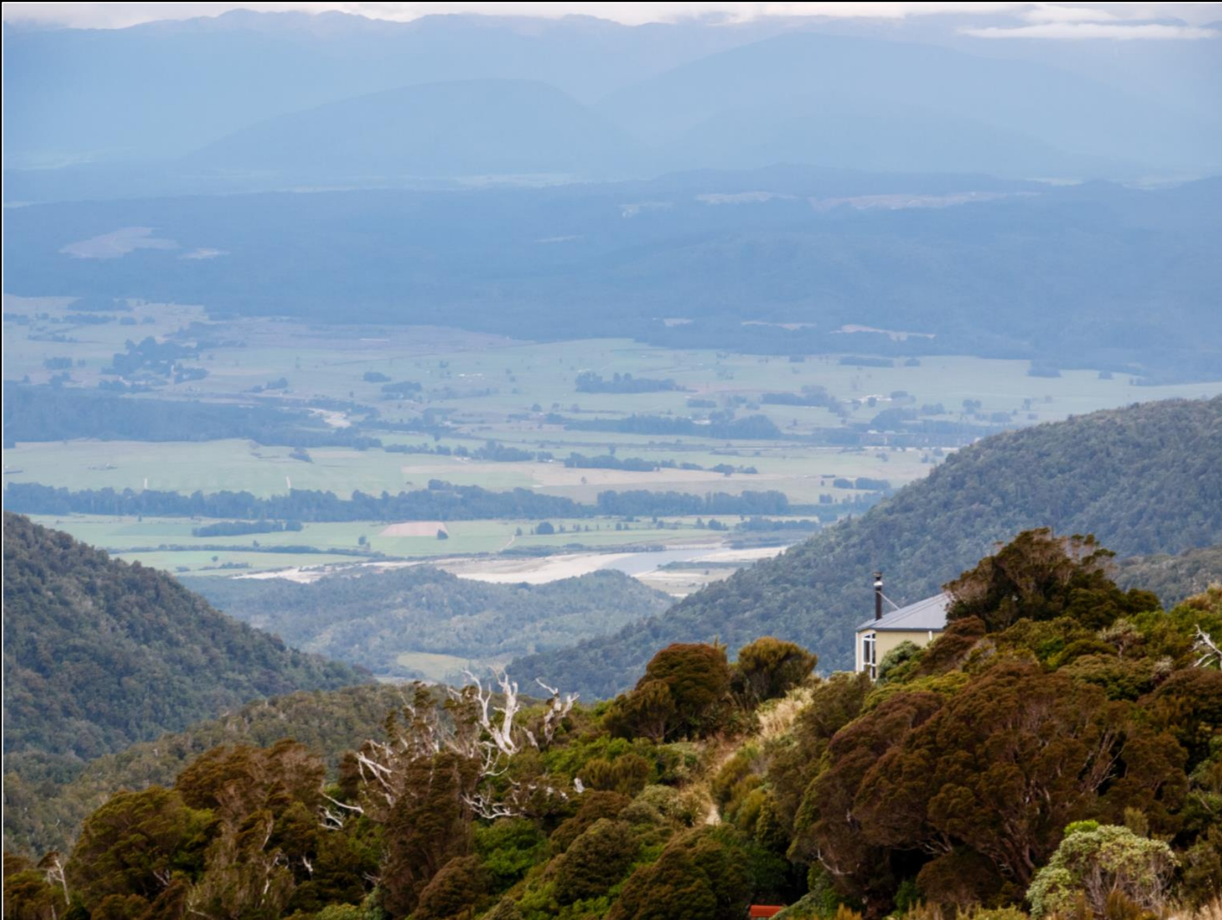
The Grey Valley