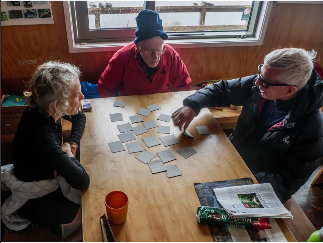
An inside afternoon

Creating the track wasn't easy. Three survey teams, each with a surveyor and a track builder, made 72 trips over eight months to establish a general route. They spent hours poring over topographical maps, studying and walking the terrain with a GPS and leaving a trail of blue marking tape along the chosen feasible route. The teams camped in the scrub and contended with swathes of jacket-tearing vegetation and every bit of weather that the Paparoas could throw at them.