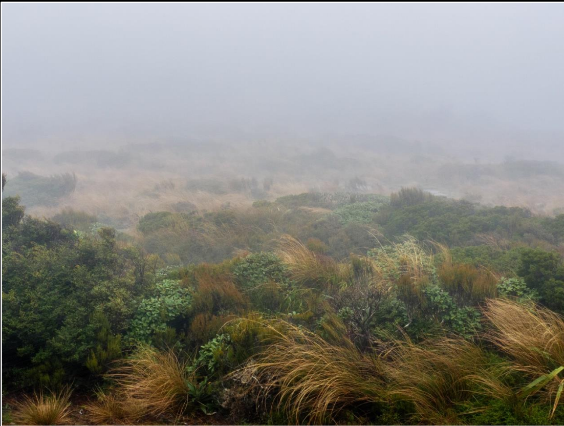
The view from the emergency shelter