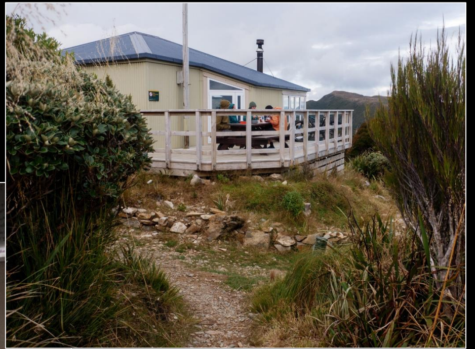
Ces Clark Hut