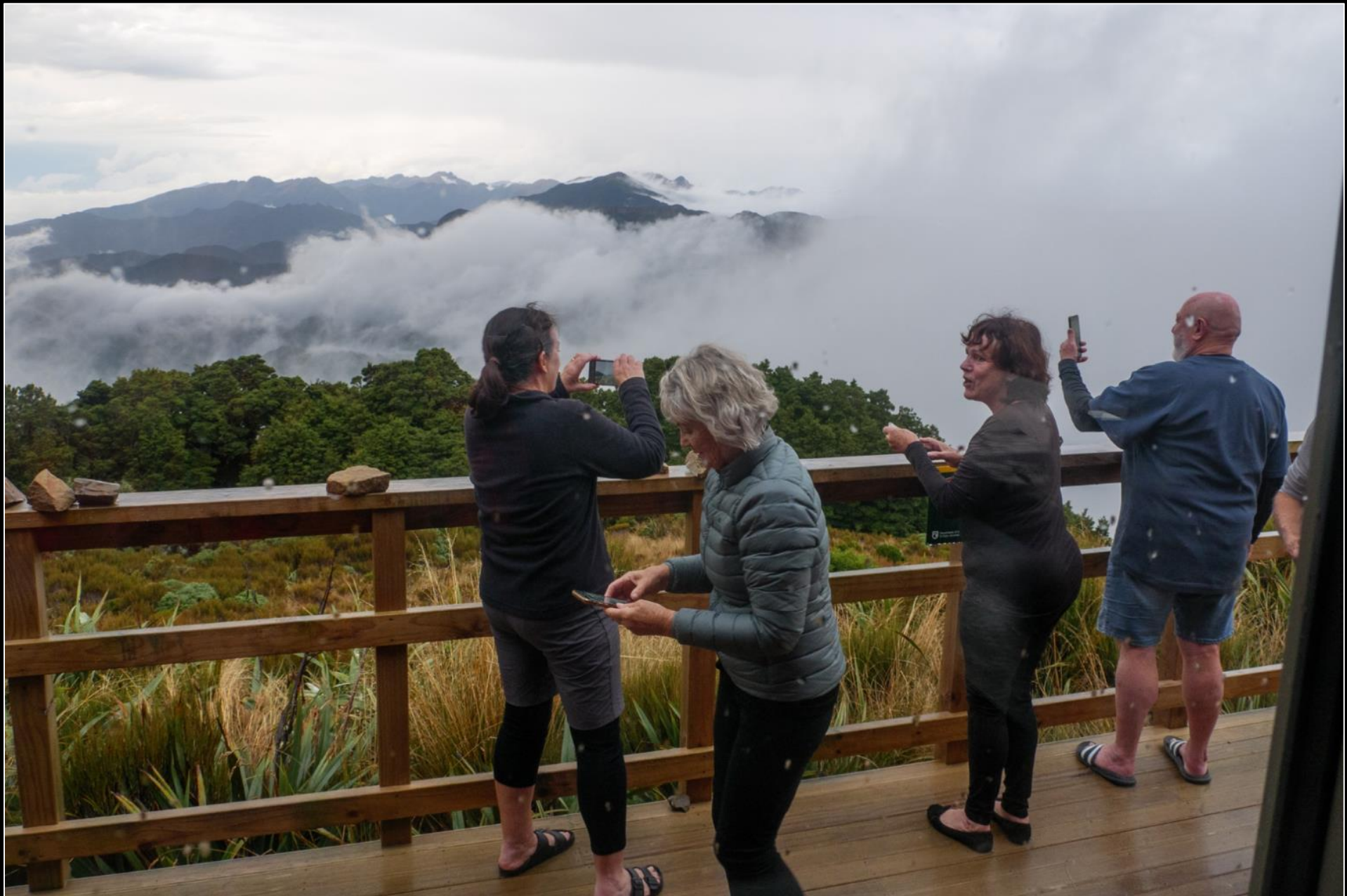
Evening excitement, clearing cloud