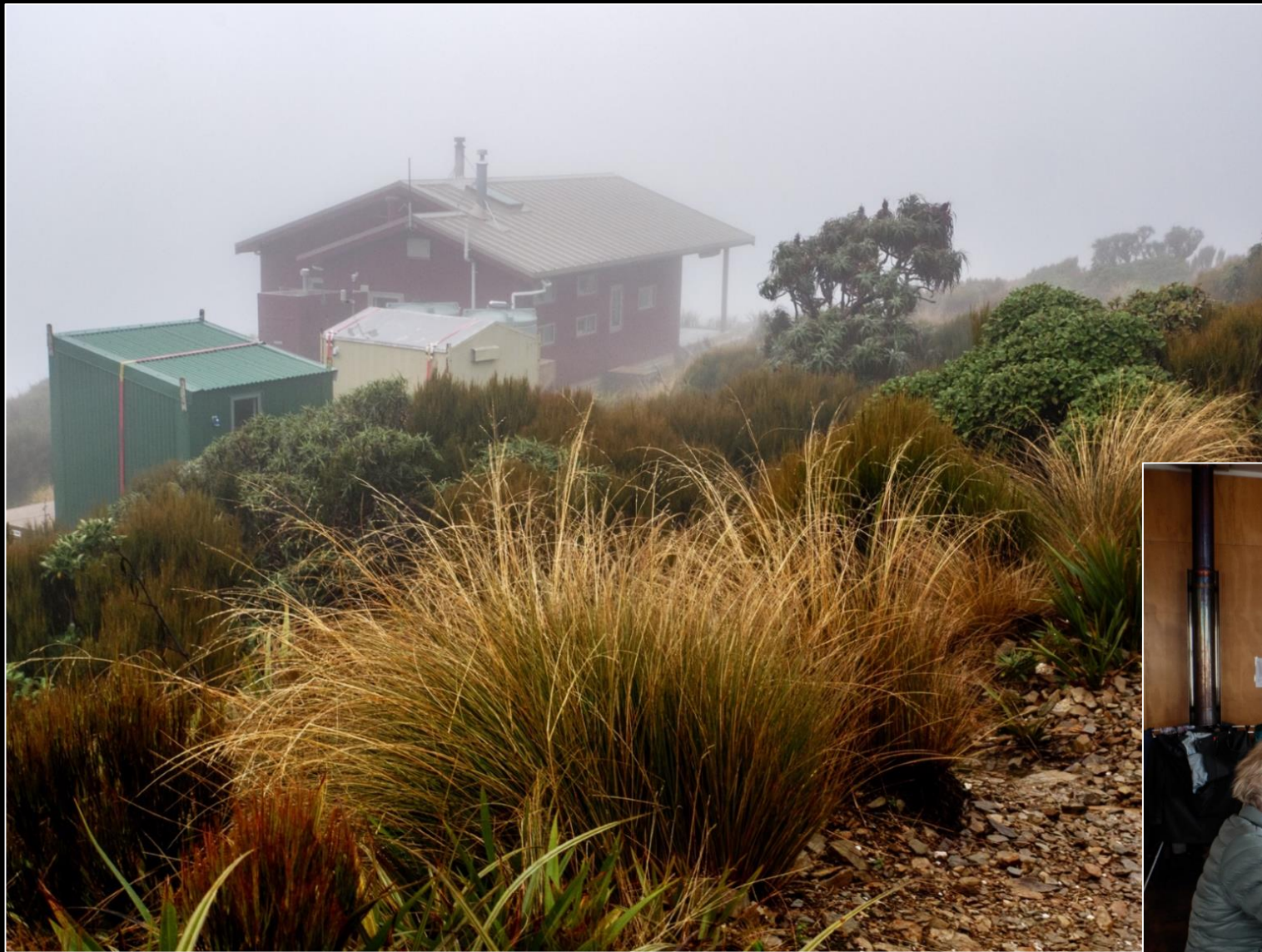
Moonlight Tops Hut