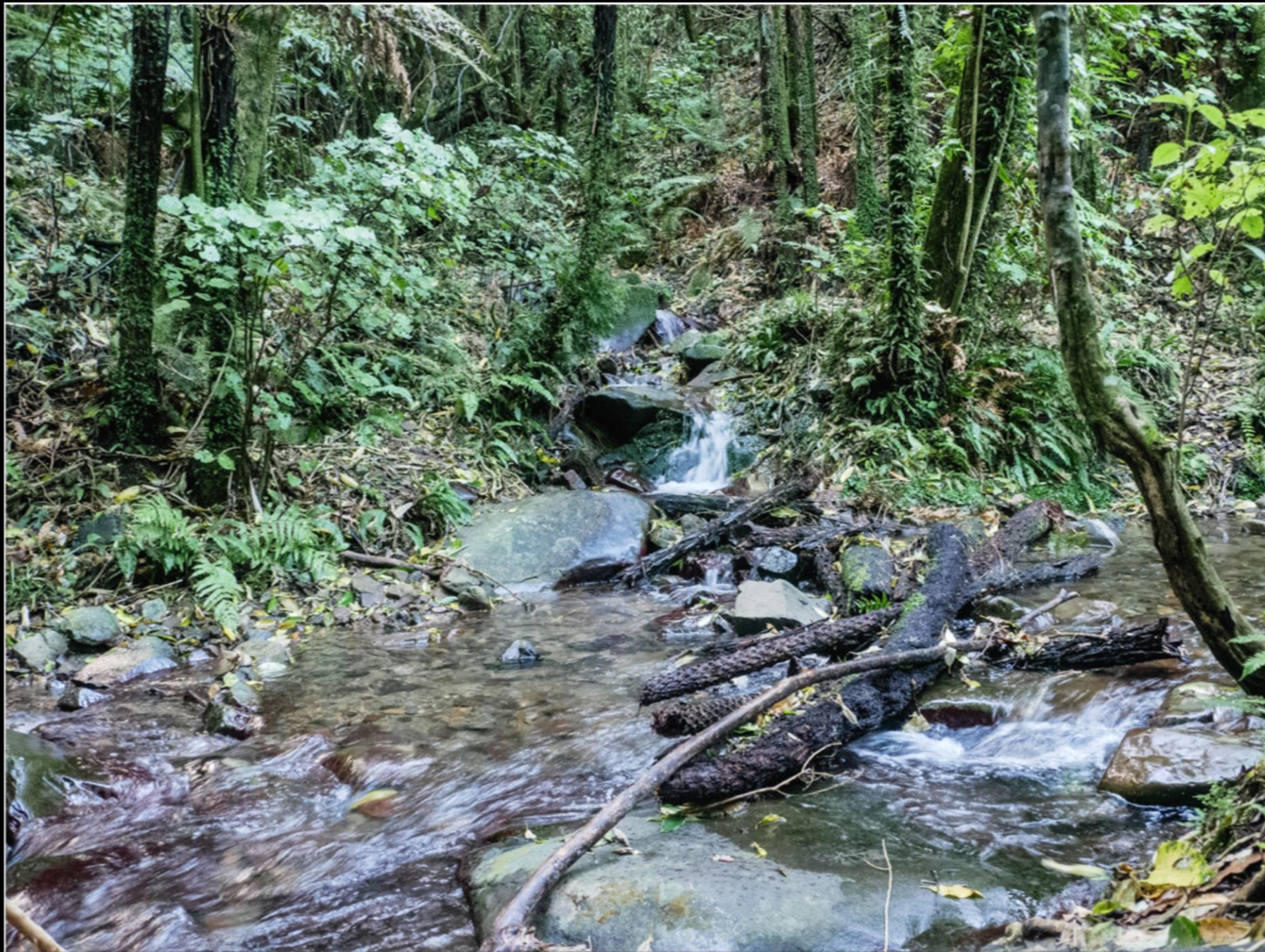
Korokoro Stream west branch