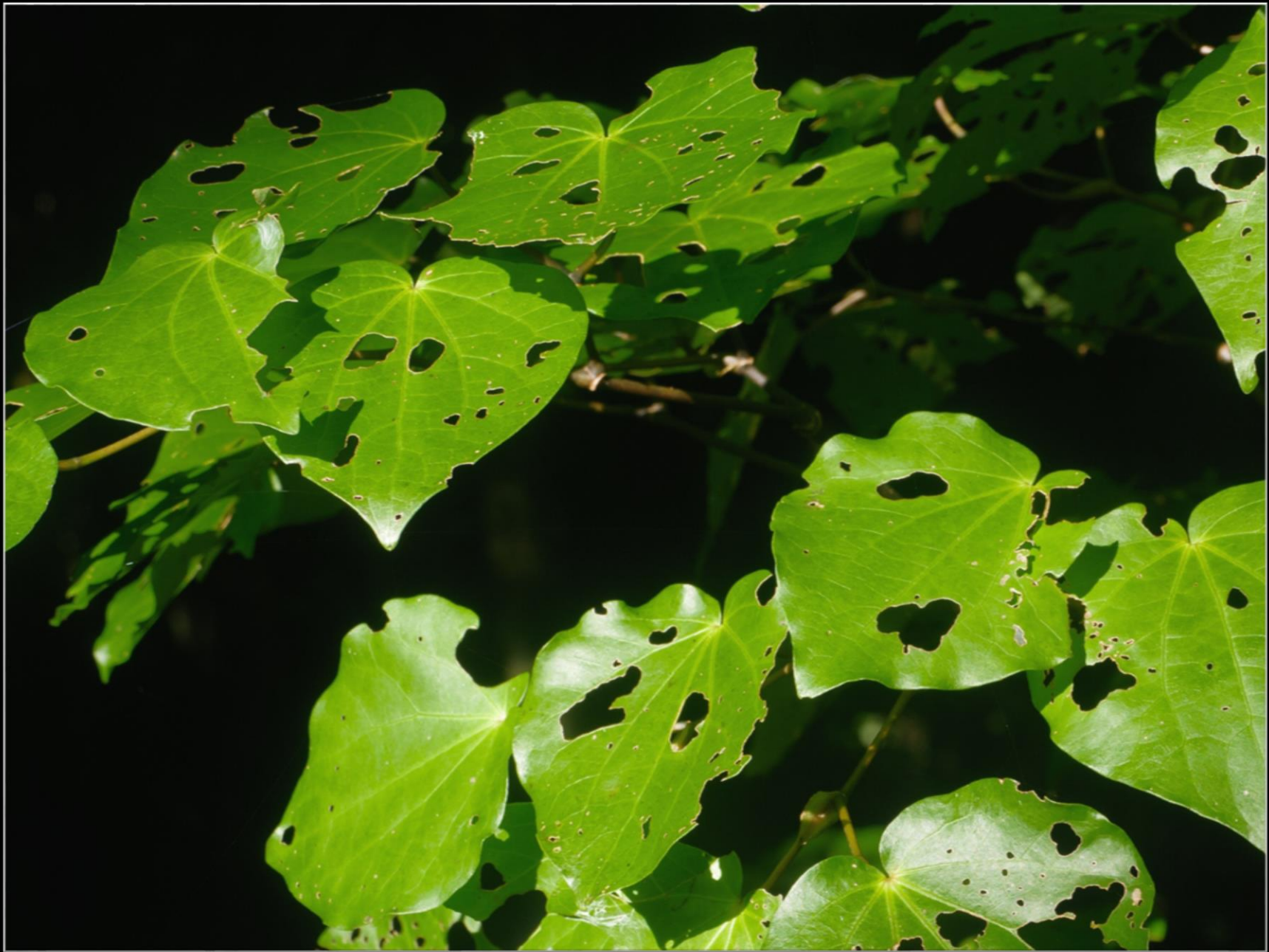
Kawakawa, Piper excelsum