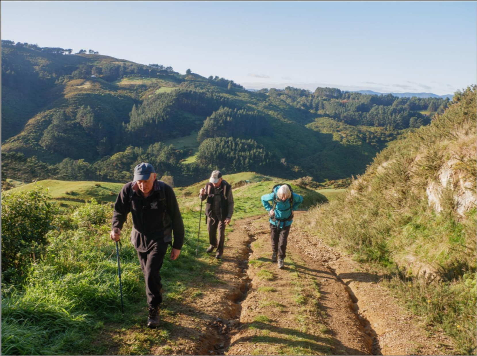
The climb from Stratton Street