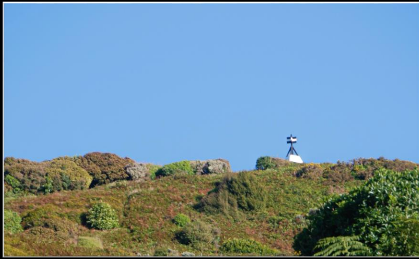
Belmont trig, 456 m