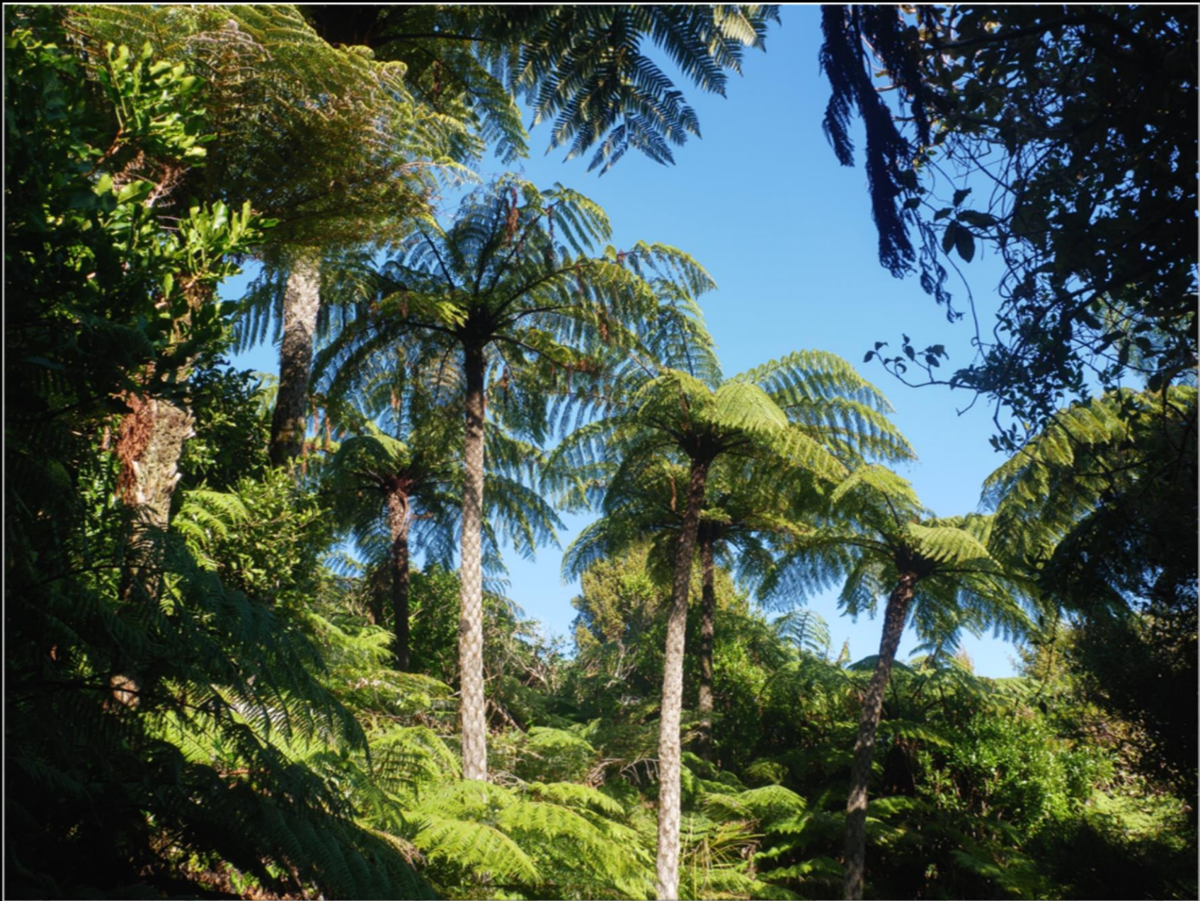
Mamaku, Cyathea medullaris