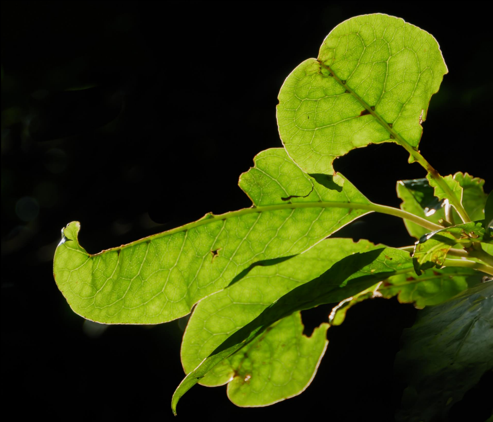
Kanono, Coprosma autumnalis