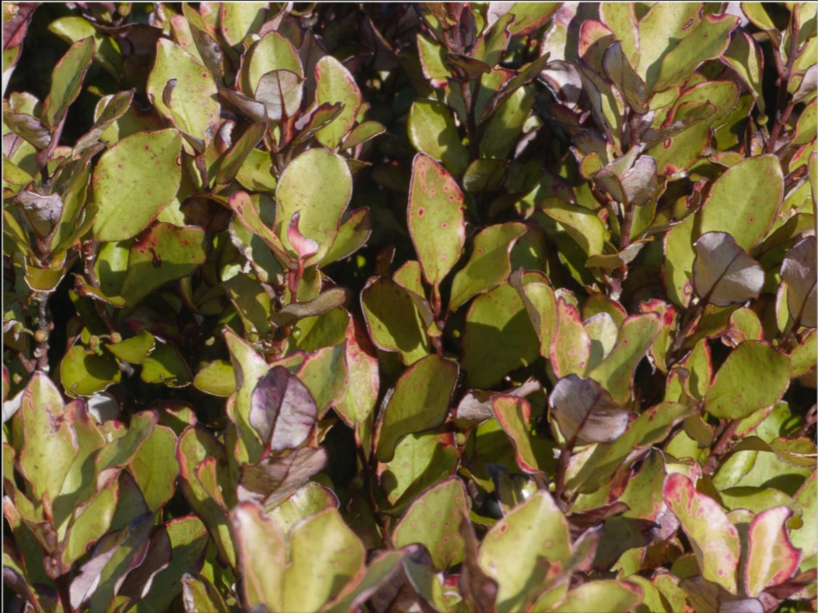
Horopito, Pseudowintera colorata