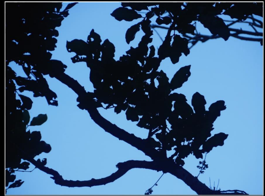
Kohekohe, Didymocheton spectabilis