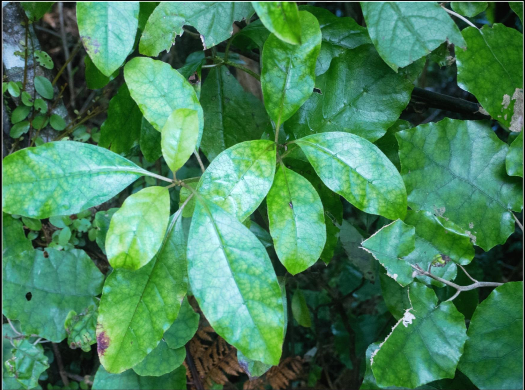
Kanono, Coprosma autumnalis